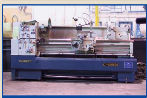
DARBERT MOD. CY-S2060B, LATHE