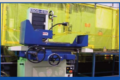
BOS 6" X 18" HYD. SURFACE GRINDER