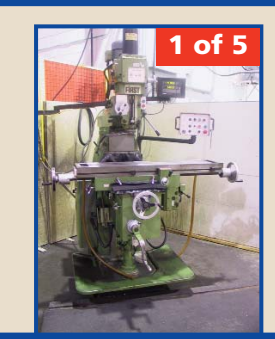
FIRST MOD. LC-20VSG TURRET MILL