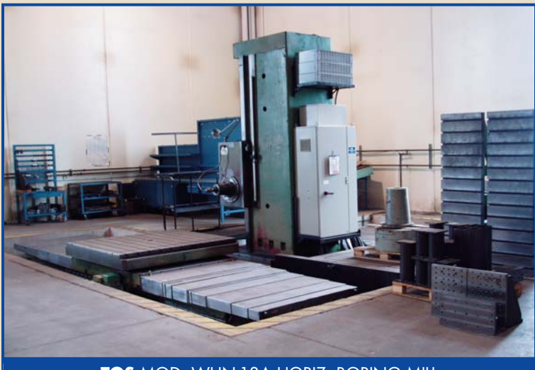
TOS MOD. WHN-13A HORIZ. BORING MILL

PREVIEW: JULY 12TH FROM 9 TO 5 AND BY APPOINTMENT