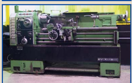
CHIEN YEH MOD. 405G X 1000 LATHE