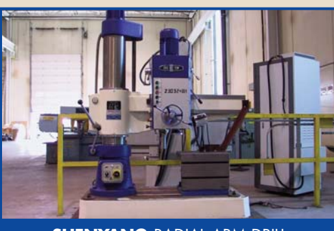
SHENYANG RADIAL ARM DRILL