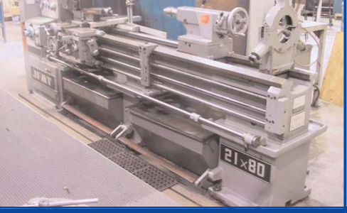
JINAN MOD. JIMK, 530X2000 GAP BED LATHE