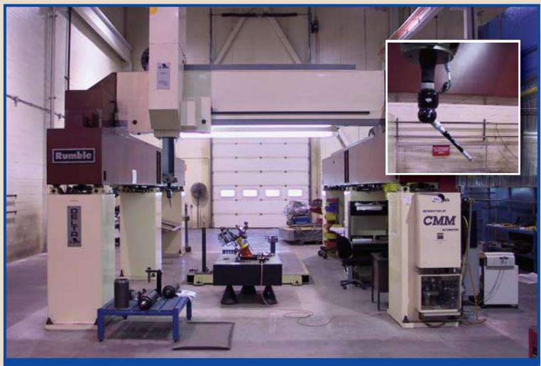
DEA MOD. 4509-023 GANTRY CMM