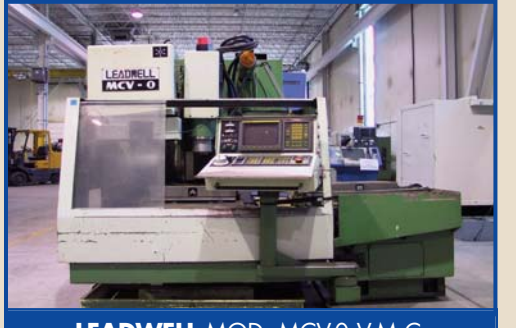
LEADWELL MOD. MCV-0 V.M.C.