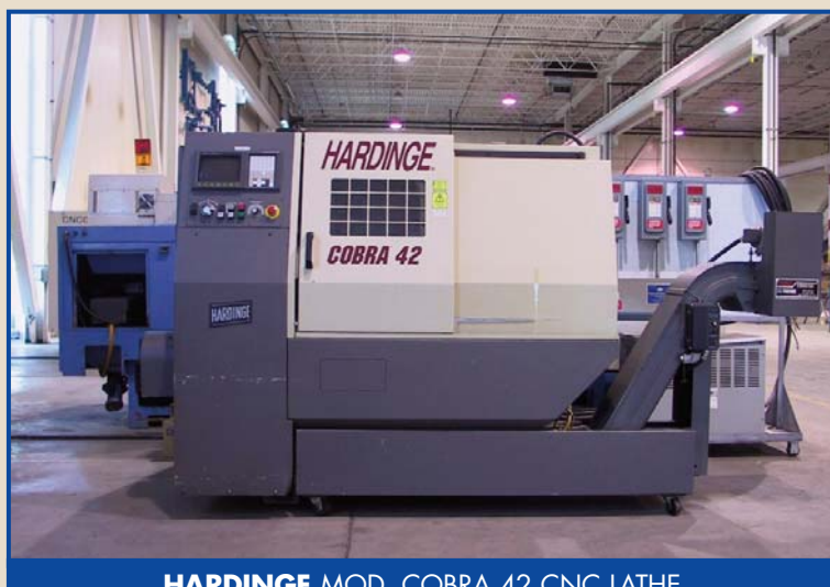
HARDINGE MOD. COBRA 42 CNC LATHE