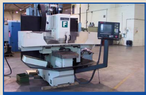
H.H.ROBERTS MOD. TE-31-TRH CNC MILL